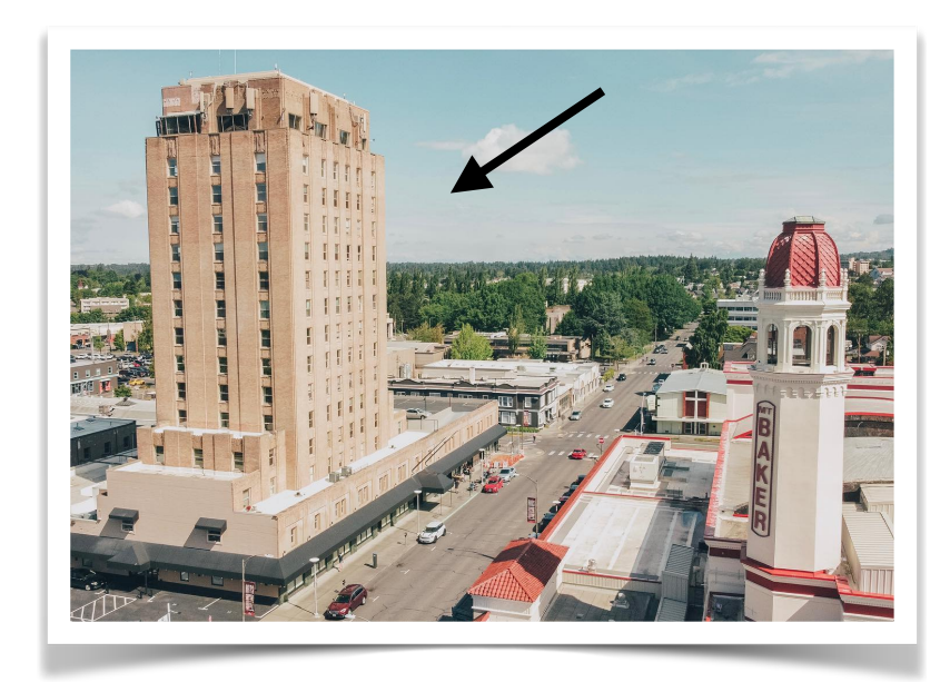
119 N. Commercial St., Bellingham Suite 490